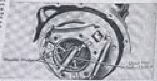
The Super Duty pickup truck is a real workhorse.

The Model 25 is a real workhorse. It's got a powerful 4.7-liter V8 engine that gives it a towing capacity of up to 7,500 pounds. And with its available 5.0-liter V8, you can tow up to 8,000 pounds. That's a lot of power for a pickup truck. And it's got a lot of other features, too. Like the available 4x4 system, which gives you the ability to tackle just about any terrain. And the available interior bike rack, which gives you a convenient way to store your bike in the truck's bed. So if you're looking for a pickup truck that can handle just about anything, the Model 25 is a real workhorse.