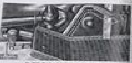
The Super Duty pickup truck is a real workhorse.

The new Ford Super Duty pickup truck is a real workhorse. It's got a powerful 4.7-liter V8 engine that gives it a towing capacity of up to 7,500 pounds. And with its available 5.0-liter V8, you can tow up to 8,000 pounds. That's a lot of power for a pickup truck. And it's got a lot of other features, too. Like the available 4x4 system, which gives you the ability to tackle just about any terrain. And the available interior bike rack, which gives you a convenient way to store your bike in the truck's bed. So if you're looking for a pickup truck that can handle just about anything, the Ford Super Duty is a real workhorse.