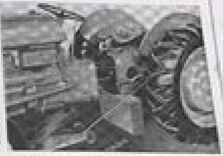
The Super Duty pickup truck is a real workhorse.

The Ford Super Duty pickup truck is a real workhorse. It's got a powerful 4.7-liter V8 engine that gives it a towing capacity of up to 7,500 pounds. And with its available 5.0-liter V8, you can tow up to 8,000 pounds. That's a lot of power for a pickup truck. And it's got a lot of other features, too. Like the available 4x4 system, which gives you the ability to tackle just about any terrain. And the available interior bike rack, which gives you a convenient way to store your bike in the truck's bed. So if you're looking for a pickup truck that can handle just about anything, the Ford Super Duty is a real workhorse.