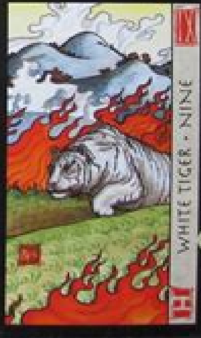
WHITE TIGER - NINE