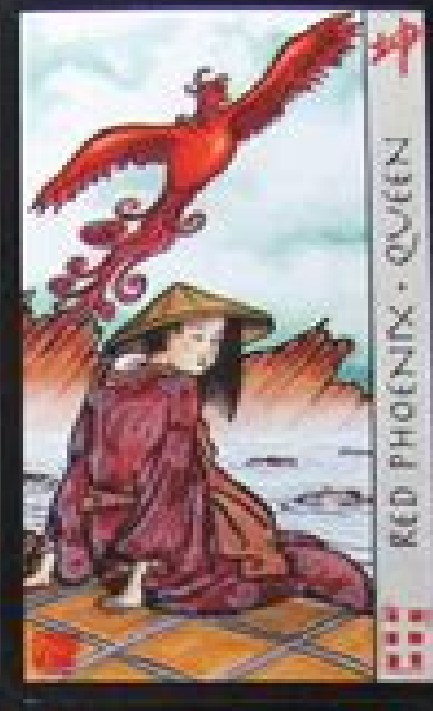
RED PHOENIX - QUEEN