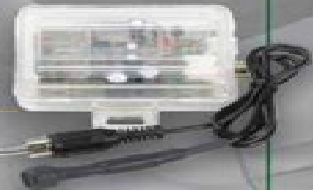
Audio Sensor AS001 See Page 2