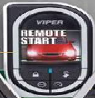
Viper Responder HD HR117 See Page 10