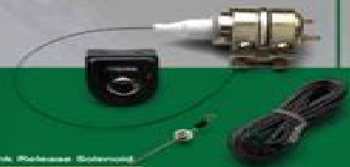
Trunk Release Solenoid KR01 See Page 9