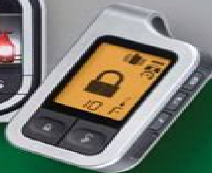
Cofford Responder LCD CR001 See Page 10