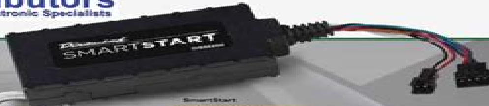
SmartStart SSM001 See Page 3