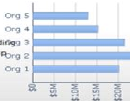
No Year Funding by Organization