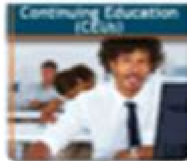
Continuing Education (CEU)

Meet your continuing education needs with aQuire Training and EasyCEU.com - our sister company offering hundreds of fully accredited CEU hours.