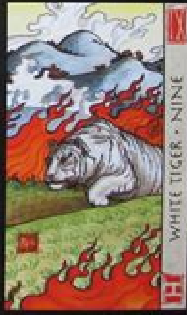
WHITE TIGER - NINE