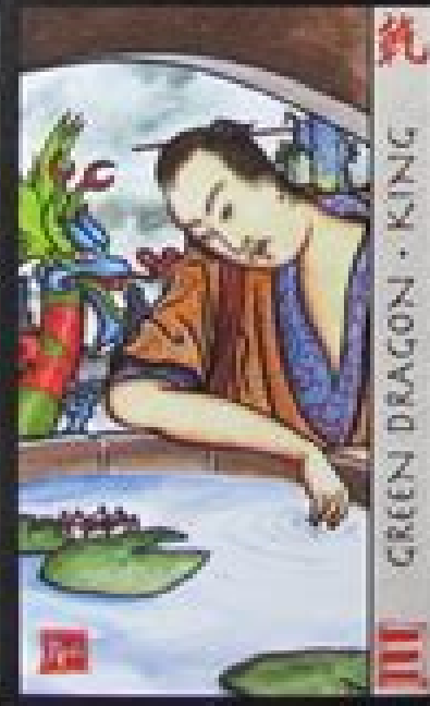
GREEN DRAGON - KING