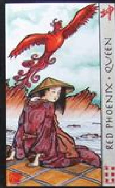
RED PHOENIX - QUEEN