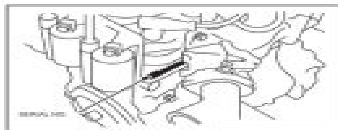
Fig. 2 – Engine Serial Number