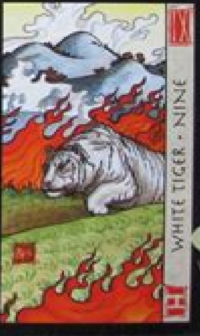
WHITE TIGER - NINE