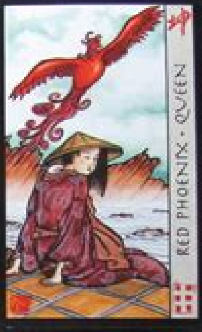
RED PHOENIX - QUEEN