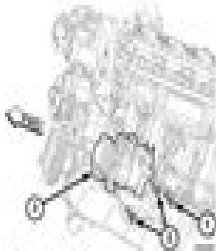
Fig. 79: AC Compressor