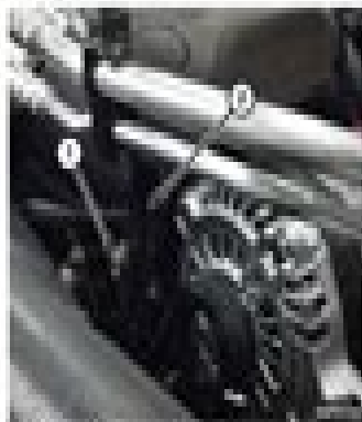
Fig. 80: AC Line Support Bracket