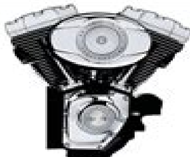
2007 Twin Cam 96 1,584 cc 80 hp