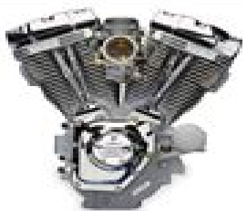
1999-2006 Twin Cam 88 1,450 cc 80 hp