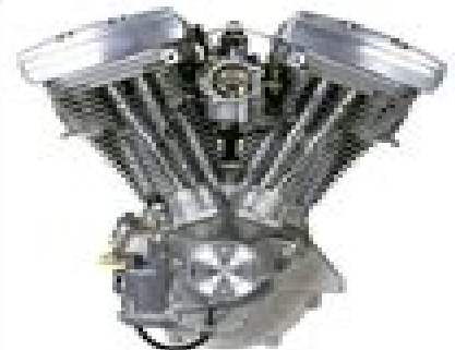
1984-1999 Evolution 1,340 cc 70 hp