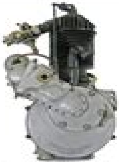
1903 Single Cylinder F-Head 35 ci 1.9 hp