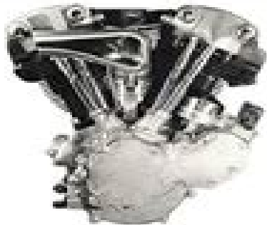
1936-1947 Knucklehead 990 cc & 1,200 cc 40 hp & 45 hp