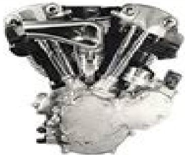
1936-1947 Knucklehead 990 cc & 1,200 cc 40 hp & 45 hp