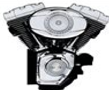
2007 Twin Cam 96 1,584 cc 80 hp