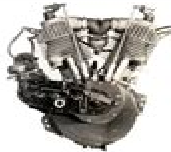
1911-1929 F-Head 50 ci 11 hp