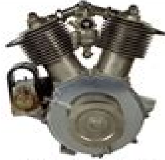
1909 First V-Twin 49 ci 6.5 hp