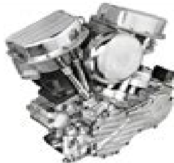
1948-1965 Panhead 990 cc & 1,200 cc 50 hp & 55 hp