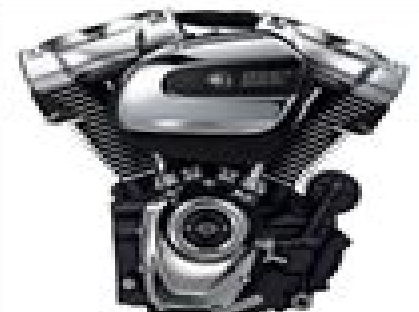
2017 Milwaukee-Eight 107 1,750 cc 92 hp