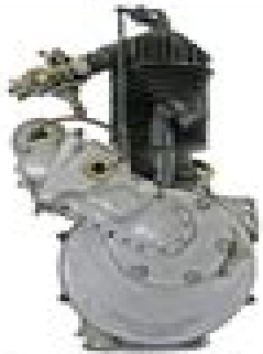
1903 Single Cylinder F-Head 35 ci 1.9 hp