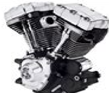
2012 Twin Cam 103 V-Twin 1,690 cc 83 hp