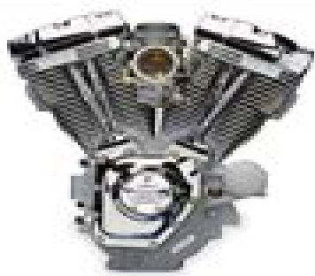
1999-2006 Twin Cam 88 1,450 cc 80 hp