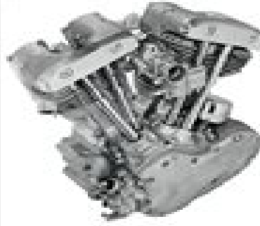
1966-1983 Shovelhead 1,208 cc 60 hp