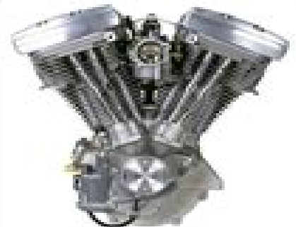
1984-1999 Evolution 1,340 cc 70 hp