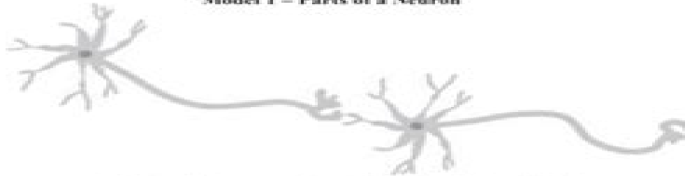
Model 1 – Parts of a Neuron

1. Model 1 is an illustration of two neurons. Label one of the neurons in the diagram with the following structures: