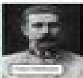
The alliance system was a major cause of the war.