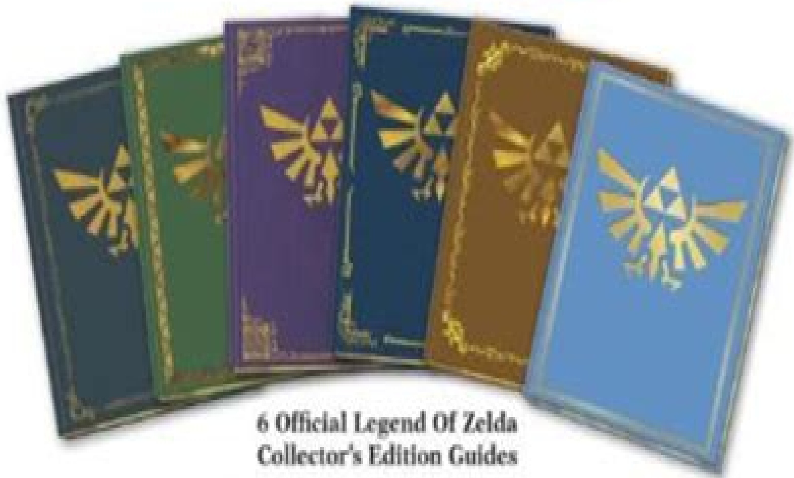
6 Official Legend Of Zelda Collector's Edition Guides