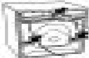
Figure 1: Anchor Bolt Installation

The following instructions describe the correct procedure for installing the anchor bolts. Always follow the instructions and safety warnings. Never disregard instructions and warnings.