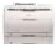
HP Color LaserJet 3800 Printer series HP Color LaserJet 3800dn shown