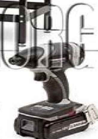
Impact drivers, p. 26