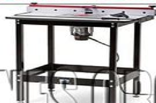
Router tables, p. 94