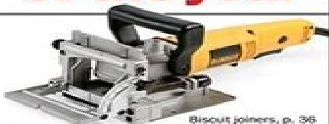
Biscuit joiners, p. 36