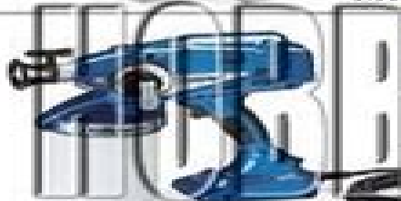
Finish sprayers, p. 86