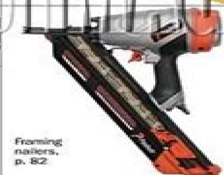
Framing nailers, p. 82