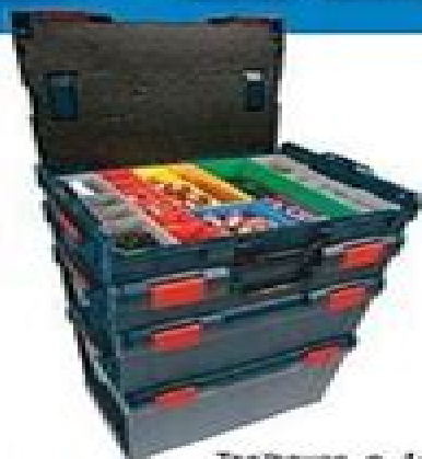
Toolboxes, p. 102