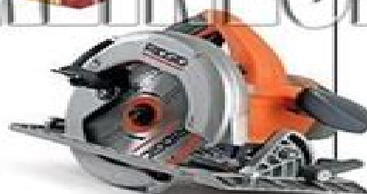
Circular saws, p. 30