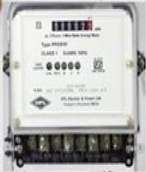
3 phase energy meter Without ct