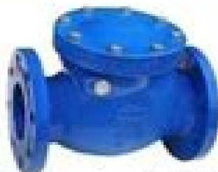
Swing Check Valve