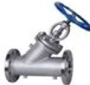
Y- Globe Valve