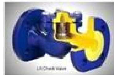
Lift Check Valve