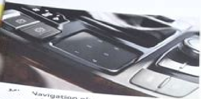
Navigation plus + Instructions