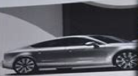
2012 Audi A7 Sportback Owner's Manual