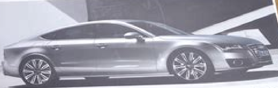
2012 Audi A7 Sportback Quick Reference Guide