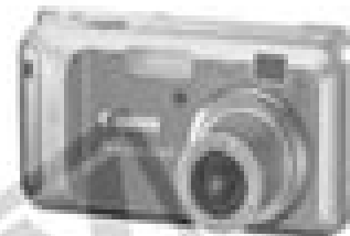
Photo of PowerShot A460