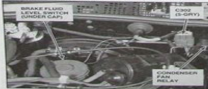
39. Left Rear Corner of Engine Compartment