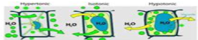
Osmosis: Movement of Water Molecules