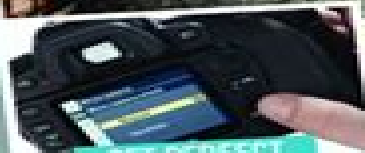
GET PERFECT WHITE BALANCE