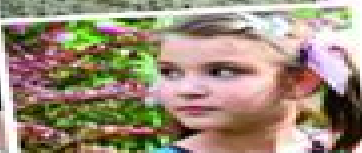
MASTER SOFT FOCUS