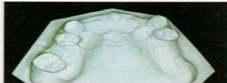
Figure 5.7 — Extent of saddles

In the restoration of these extensive saddles the tooth support offered by the remaining teeth must be augmented by mucosal support derived from extensive palatal coverage.