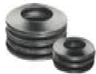
Disc or Belleville Spring