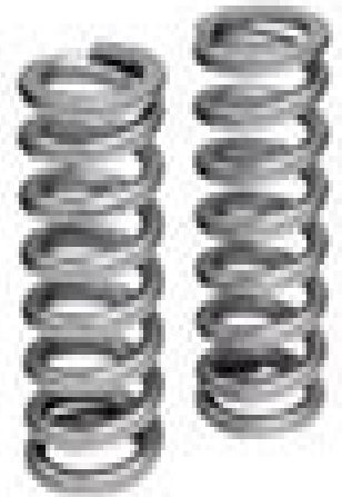
Helical Compression Spring