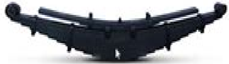
Laminated or Leaf Spring