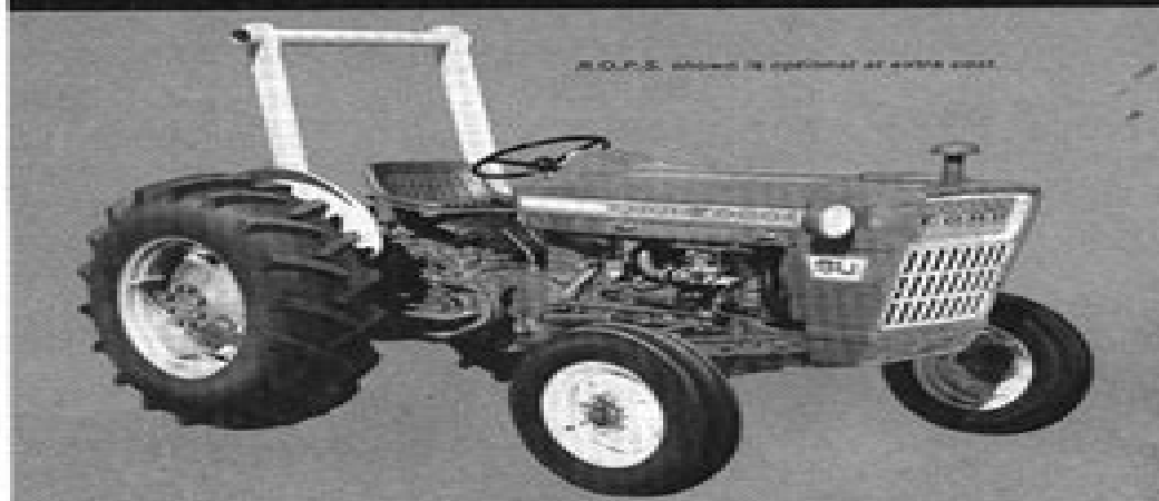
R.O.P.S. shown is optional at extra cost.