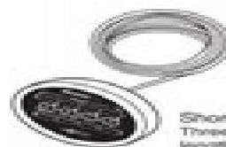
Shortcut #E22 Three different cable lengths available.