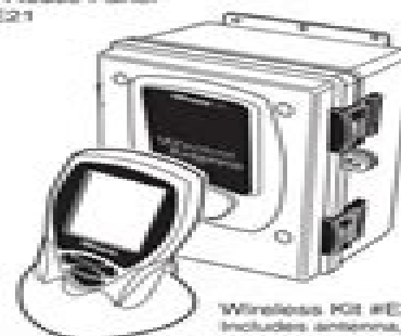
Wireless Kit #E20 Includes antenna, remote and charging base.