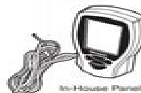
In-House Panel #E21