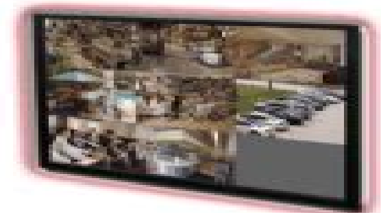
Monitor not included. Features simulated.

A reliable cost effective surveillance solution, best suited for our times.