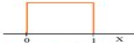
Figure 1.35 The density curve of a uniform distribution, for exercise 1.80.

1.80 If you ask a computer to generate "random numbers between 0 and 1, you uniform will get observations from a uniform distribution . Figure 1.35 graphs the distribution density curve for a uniform distribution. Use areas under this density curve to answer the following questions. Define the random variable X to be the value that is generated by the computer.