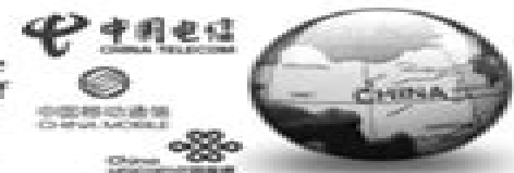
For years, China's only 3 wireless companies have been owned by the Chinese government.

So let's talk about that for a minute. What if there were only one cell phone provider: the government? What if the government controlled production of everything else, too—cars, shoes, cereal, and even television sets? In that case, we would have what is called a command economy , in which the government owns and offers all the goods and services and decides what those goods and services will cost. When you went looking for cell phone service, there would only be one choice and one set of prices.