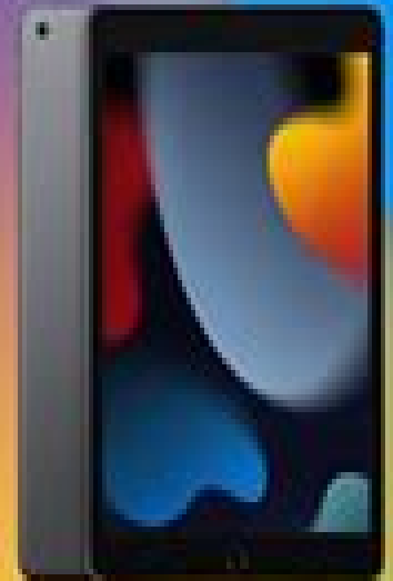
iPad (9 th generation)