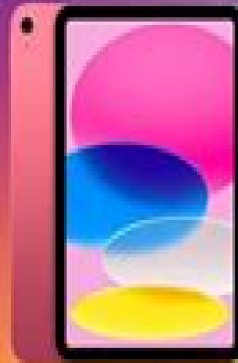
iPad (10 th generation)