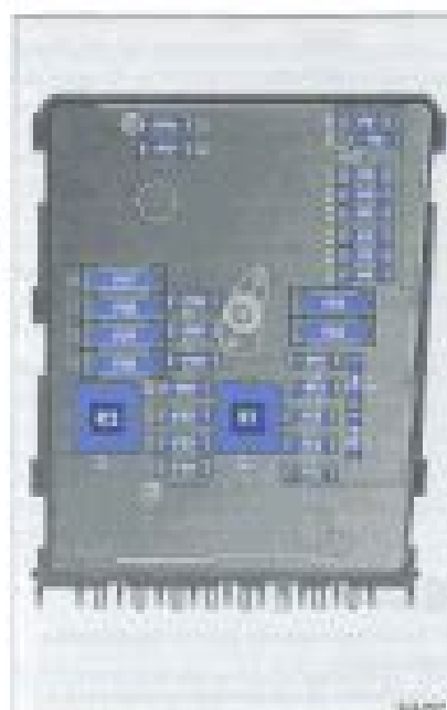
Fig. 41 Fusibles de la caja de fusibles del vano motor Versión A (Low End)