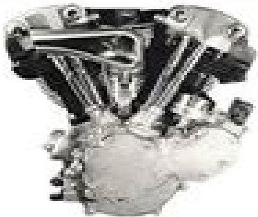
1936-1947 Knucklehead 990 cc & 1,200 cc 40 hp & 45 hp