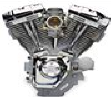
1999-2006 Twin Cam 88 1,450 cc 80 hp