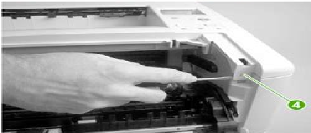
Figure 5-47 Removing the top cover (3 of 5)