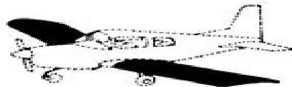
FIGURE 2. WING ASSEMBLY & INSTALLATION