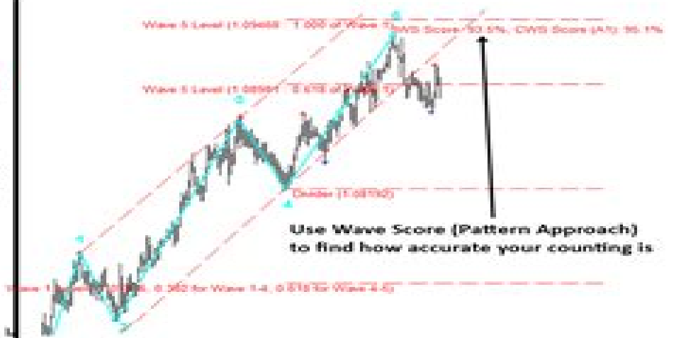
Example Wave Counting using Elliott Wave Trend