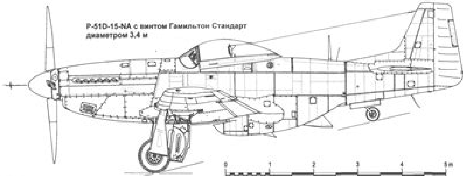
Р-51D-15-NA с винтом Гамильтон Стандарт диаметром 3,4 м