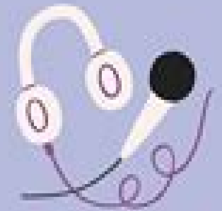
Interviewing & active listening