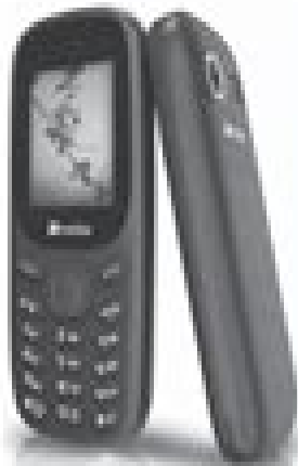
MANUAL DE USUARIO BMOBILE K370