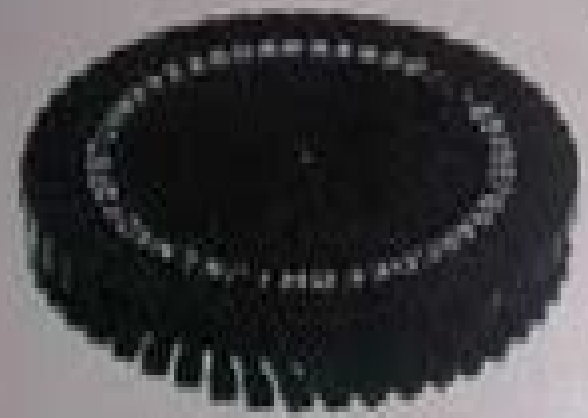
0.200 x 30