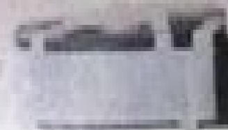
0.200 x 20