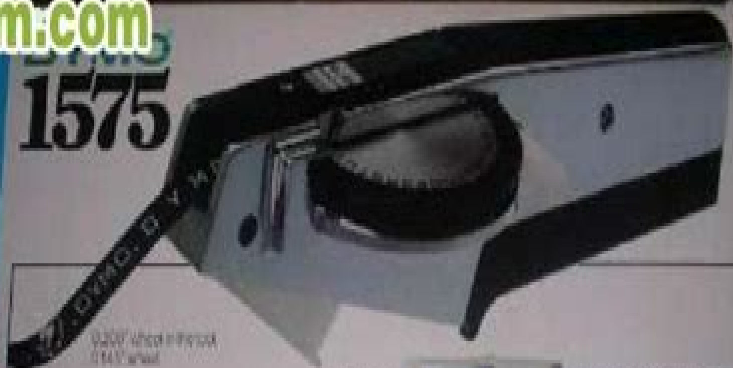
0.200 wheel in front 0.140 wheel