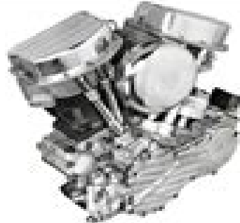
1948-1965 Panhead 990 cc & 1,200 cc 50 hp & 55 hp