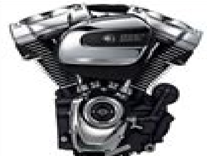
2017 Milwaukee-Eight 107 1,750 cc 92 hp