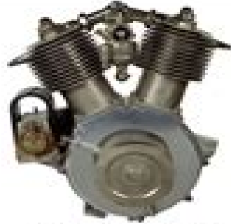
1909 First V-Twin 49 ci 6.5 hp