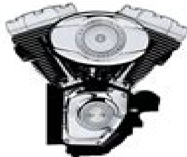
2007 Twin Cam 96 1,584 cc 80 hp