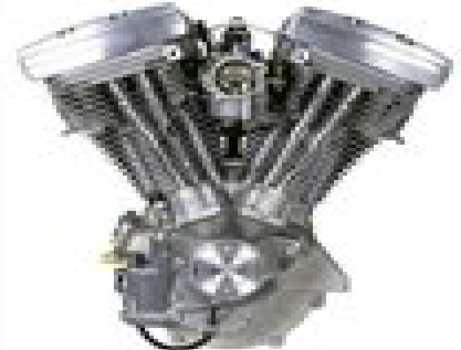
1984-1999 Evolution 1,340 cc 70 hp