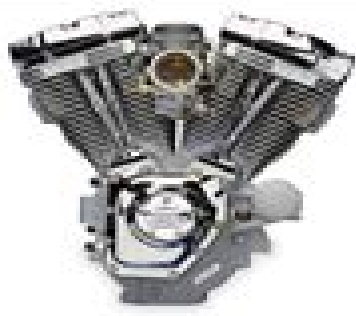
1999-2006 Twin Cam 88 1,450 cc 80 hp