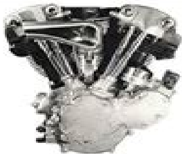
1936-1947 Knucklehead 990 cc & 1,200 cc 40 hp & 45 hp