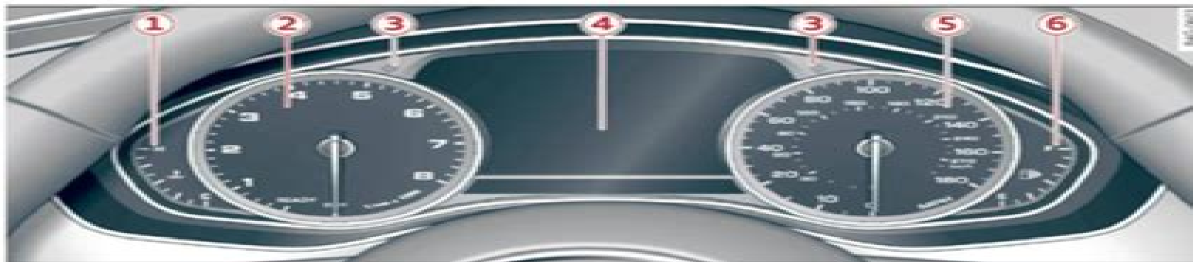
Fig. 3 Instrument cluster overview

The instrument cluster is the central information center for the driver.