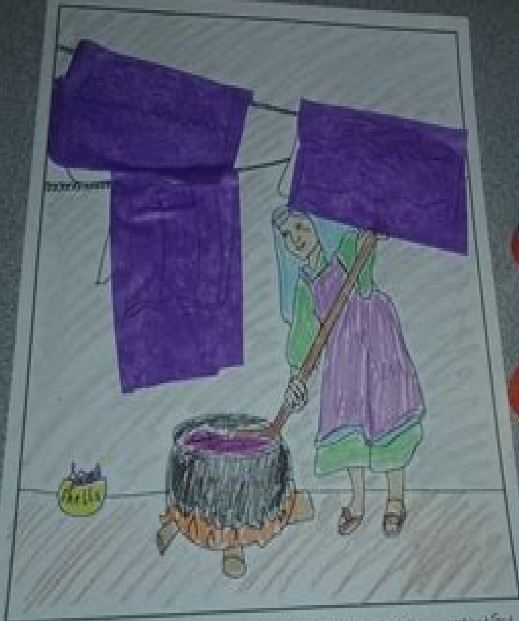
Acts 16:14 - Lydia from Thyatira, a merchant of expensive purple cloth, ... worshiped God. As she listened to us, the Lord opened her heart, and she accepted what Paul was saying.