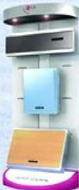
LG Duct-Free Split Air Conditioning System