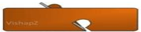
Old Style Plane